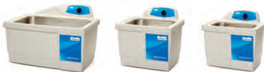
M550, M250 and M150 Soniclean® Ultrasonic Cleaners

9A404001 - Top Cover Protector 9A402001 - Door Tray 9A401001 - Printer