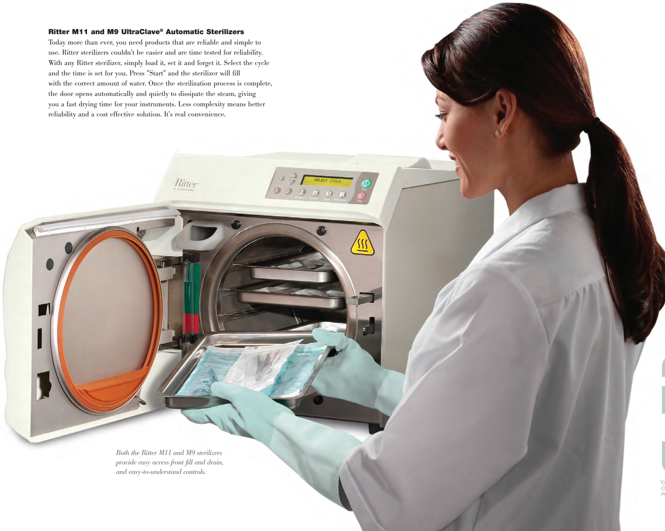
Both the Ritter M11 and M9 sterilizers provide easy access front fill and drain, and easy-to-understand controls.

Today more than ever, you need products that are reliable and simple to use. Ritter sterilizers couldn't be easier and are time tested for reliability. With any Ritter sterilizer, simply load it, set it and forget it. Select the cycle and the time is set for you. Press "Start" and the sterilizer will fill with the correct amount of water. Once the sterilization process is complete, the door opens automatically and quietly to dissipate the steam, giving you a fast drying time for your instruments. Less complexity means better reliability and a cost effective solution. It's real convenience.